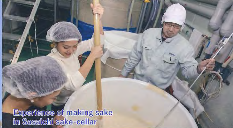
Experience of making sake in Sasaichi sake-cellar

Experience of making sake in Sasaichi sake-cellar! Seeing the process of making sake will make you feel sake more delicious.