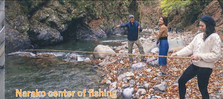
Narako center of fishing

[Address] 6188 Otsukimachi Magi Otsuki Yamanashi [TEL] 0554-23-1021