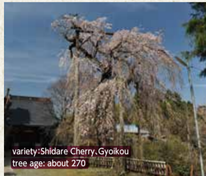
variety: Shidare Cherry, Gyoikou tree age: about 270

Access: bus stop "Kamazawa-Iriguchi" gets off -- on foot 130 minutes. Address: Sanogawa, Midori-ku Sagami-hara-shi HUJINO TOURISM ASSOCIATION Tel: 042-687-5581