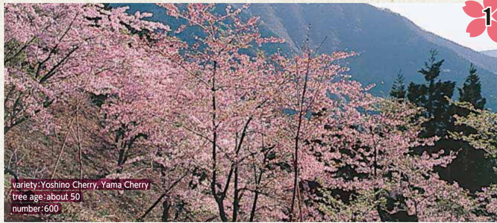
variety: Yoshino Cherry, Yama Cherry tree age: about 50 number: 600