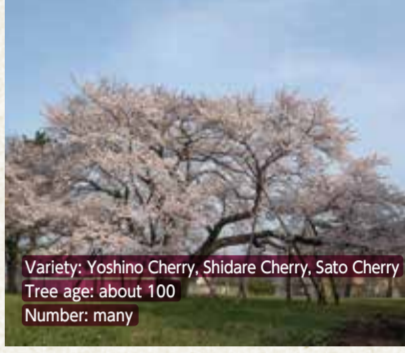
Variety: Yoshino Cherry, Shidare Cherry, Sato Cherry Tree age: about 100 Number: many

Access: On foot from JR Huchinobe Station 3 minutes. Address: 2-15-1, Kanumadai, Chuo-ku Sagami-hara-shi Kanuma park Tel: 042-755-9781