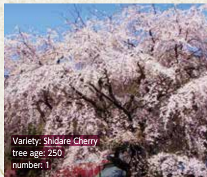
variety: Shidare Cherry tree age: 250 number: 1

Access: bus stop "Narai" gets off -- on foot 15 minutes. Address: 691, Matano, Midori-ku Sagami-hara-shi Ozaki Gakudo Hall Tel: 042-784-0660