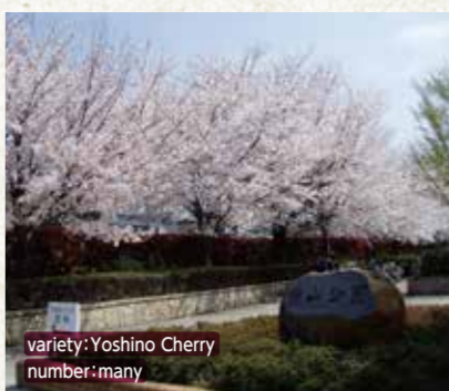
variety: Yoshino Cherry number: many

Access: ① bus stop "Shiyakusyo-mae" gets off. ② On foot from JR Sagami-hara Station 15 minutes. Address: 2, Chuo, Chuo-ku Sagami-hara-shi SAGAMIHARA TOURISM ASSOCIATION Tel: 042-771-3767