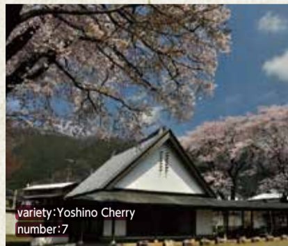
variety: Yoshino Cherry number: 7

Access: bus stop "Oku-Sagamiko" gets off -- on foot 3 minutes. Address: 807-2, Aone, Midori-ku Sagami-hara-shi Aone Midori-no Kyuka-Mura Tel: 042-787-2215