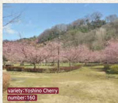
variety: Yoshino Cherry number: 160

Access: bus stop "Ohto" gets off -- on foot 25 minutes. Address: Kawajiri, Midori-ku Sagami-hara-shi SHIROYAMA TOURISM ASSOCIATION Tel: 042-783-8065