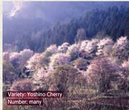
variety: Yoshino Cherry Number: many

Access: bus stop "before the Sagami-Rinkan park" gets off -- on foot 2 minutes. Address: 1432, Wakayanagi, Midori-ku Sagami-hara-shi SAGAMIKO TOURISM ASSOCIATION Tel: 042-684-2633