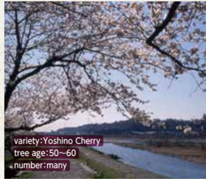
variety: Yoshino Cherry tree age: 50-60 number: many

Access: bus stop "Sagami-gawa-Shizen-no-mura" gets off -- on foot 5 minutes. Address: 3657, Oshima, Midori-ku Sagami-hara-shi OSHIMA TUORISM ASSOCIATION Tel: 042-760-6066