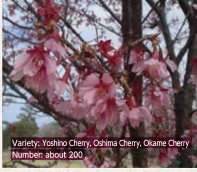
Variety: Yoshino Cherry, Oshima Cherry, Okame Cherry Number: about 200

Access: On foot from JR Harataima Station 15 minutes. Address: 3277, Shimomizo, Minami-ku Sagami-hara-shi ASAMIZO TOURISM ASSOCIATION Tel: 042-778-2504