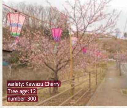
variety: Kawazu Cherry Tree age: 12 number: 300

Access: bus stop "Before the Pleasure Forest" get off. Address: 1634, Wakayanagi, Midori-ku Sagami-hara-shi Resort of the Lake Sagami Pleasure Forest Tel: 042-685-1111