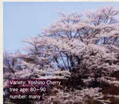
variety: Yoshino Cherry tree age: 80-90 number: many

Access: bus stop "before the Tsukui-Kankou center" gets off. Address: 162, Negoya, Midori-ku Sagami-hara-shi TUKUI TOURISM ASSOCIATION Tel: 042-784-6473