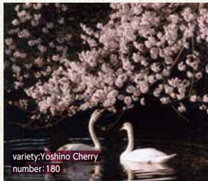
variety: Yoshino Cherry number: 180

Access: On foot from JR Kamimizo Station 7 minutes. Address: 5-11-50, Yokoyama, Chuo-ku Sagami-hara-shi Yokoyama park Tel: 042-758-0886