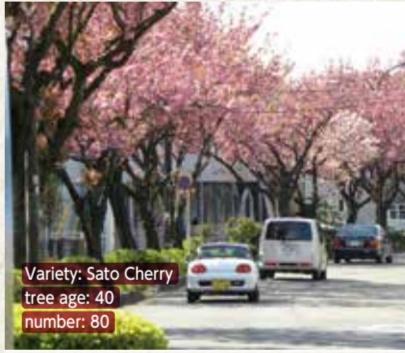
Variety: Sato Cherry tree age: 40 number: 80

Access: On foot from JR Harataima Station 25 minutes. Address: 1889 / 2317, Asamizo, Minami-ku Sagami-hara-shi Sagami-hara park Tel: 042-778-1653 / Sagami-hara-Asamizo park Tel: 042-777-3451