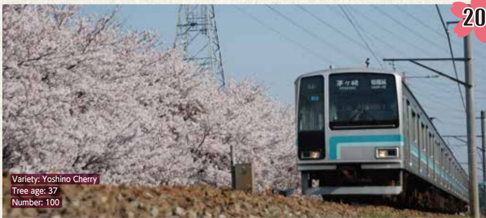
Variety: Yoshino Cherry Tree age: 37 Number: 100

Access: On foot from JR Harataima Station 15 minutes. Address: Shimomizo, Minami-ku Sagami-hara-shi ASAMIZO TOURISM ASSOCIATION Tel: 042-778-2504