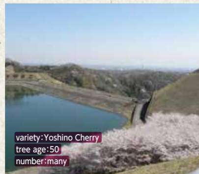
variety: Yoshino Cherry tree age: 50 number: many

Access: bus stop "Shimo-Inou" gets off. Address: Nagatake, Midori-ku Sagami-hara-shi TUKUI TOURISM ASSOCIATION Tel: 042-784-6473