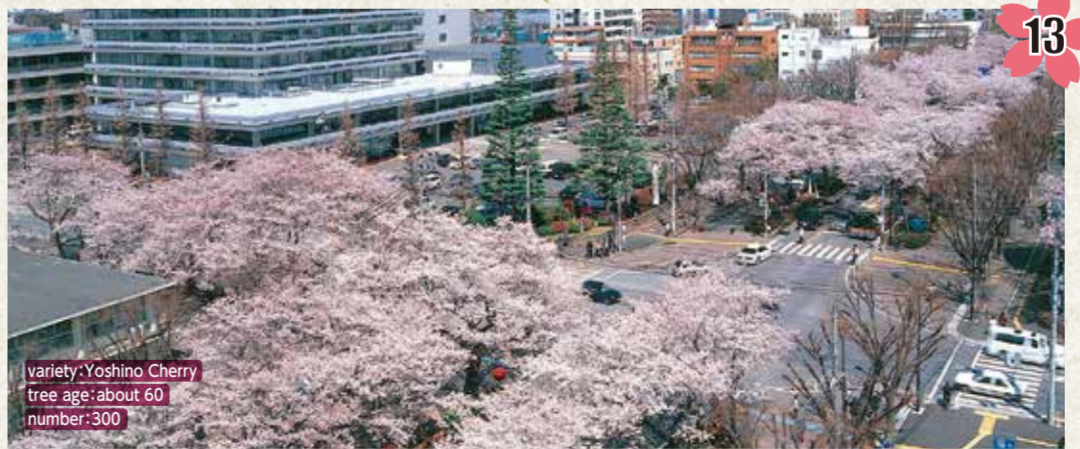
variety: Yoshino Cherry tree age: about 60 number: 300

Access: bus stop "Suigo-Tana" gets off -- on foot 7 minutes. Address: Suigotana, Chuo-ku Sagami-hara-shi SAGAMIHARA TOURISM ASSOCIATION Tel: 042-771-3767